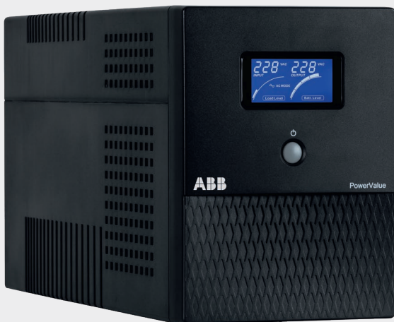
ABB presents a superior uninterruptible power supply (UPS) that benefits from the technology, engineering and quality inherent in ABB's high-end UPS products.

A full-featured, network-grade line-interactive UPS ideal for entry-level network equipment